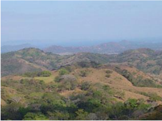
Figure1. Land Uses in the Península de Nicoya Region-Costa Rica

Presently, approximately 45% of cleared land in the North Pacific Zone of Costa Rica is under permanent pasture. Much of this was cleared directly from the forests. Now that much of the original forest is gone, prior land use has created enormous biological debt: a large area of degraded pastures. Cattle production in Costa Rica requires relatively few external and labor inputs when compared to other cash crops such as pineapple, oranges, coffee and bananas, and for many of these deforested lands, cattle production is currently the best land use option for many farmers. The project will look for providing new options to these farmers, using the incomes from carbon credits generated by forest restoration activities. Recent research in the area suggested that although aware